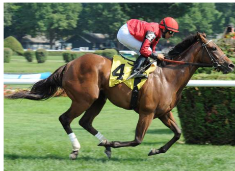
Sage Hall | NYRA

The Kansan is a third-generation cattle rancher. The family ranch in Hanover is one of the oldest and largest